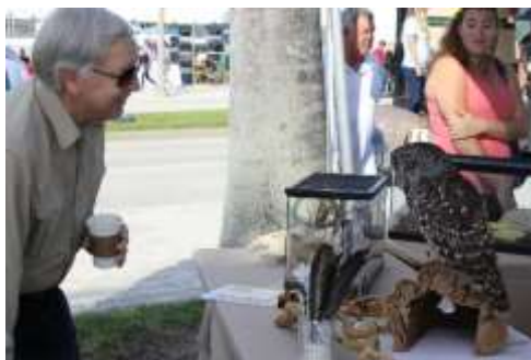
An owl encounter _ The Busch Wildlife Sanctuary

BUSCH WILDLIFE SANCTUARY will be offering the opportunity to learn about Florida's native wildlife through hands-on activities including animal identification, hospital help and more!